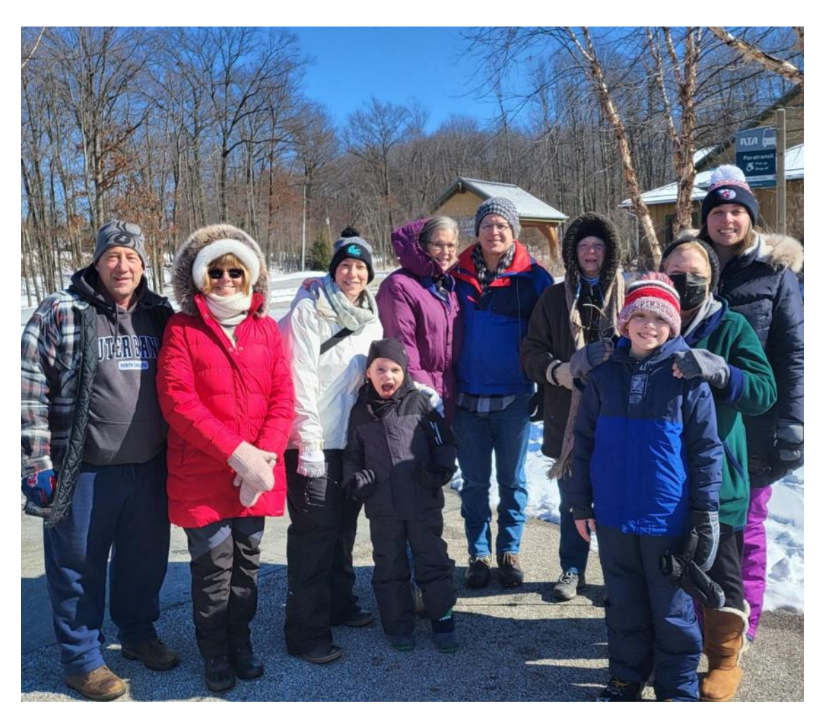
Eleven of us braved the 30-degree weather for a hike at the West Creek Reservation on February 18th. We enjoyed fellowship and sunshine.